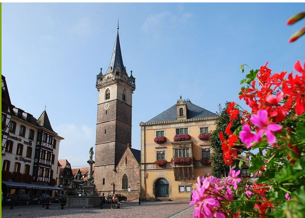
Obernai - Kappelturm

The turn of the 20th century was marked by a new period of modernisation.